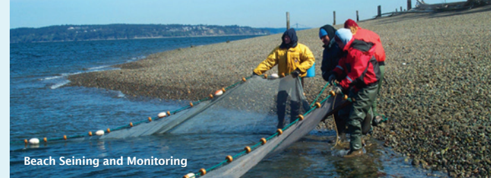
Beach Seining and Monitoring