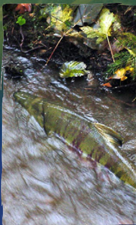
Kennedy Creek Chum

Unfortunately, for the last century we have often competed with salmon for these essential resources. Historically we have blocked rivers and filled wetlands, diked estuaries and polluted our water. We have harvested the forests and paved over the floodplains. Some say we may have overfished and under-protected.