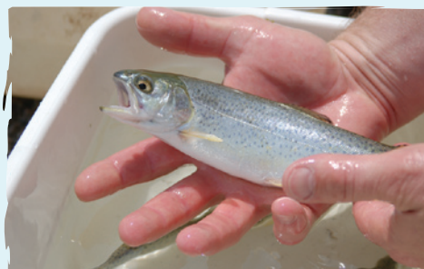
Puget Sound Coastal Cutthroat

Our non-profit, non-government, and non-political status helps us accomplish what governmental agencies alone cannot do: get real results, real quick.