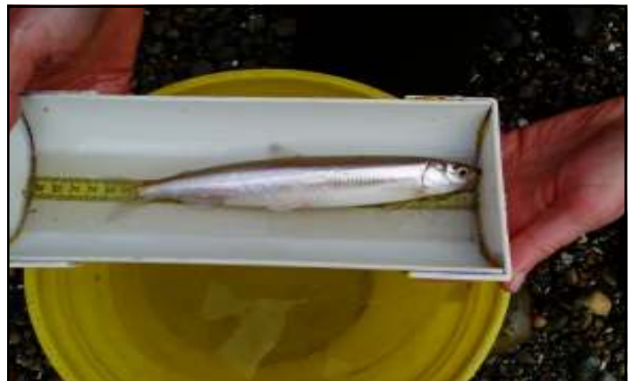
Adult surf smelt netted near Nisqually Estuary.