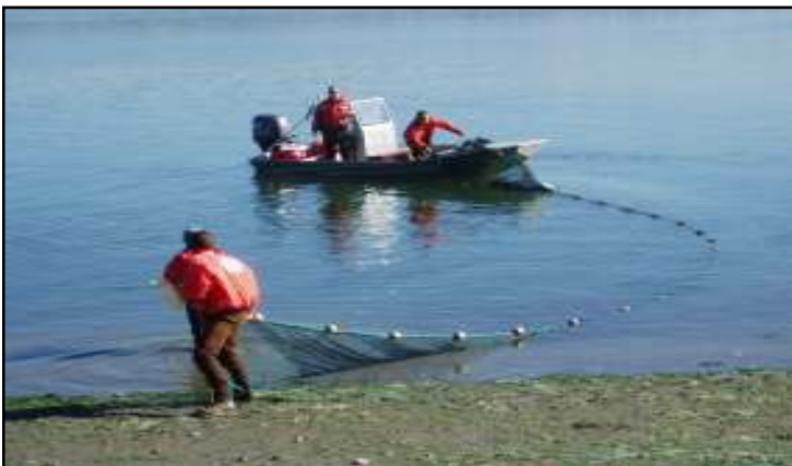
Beach seining in the Nisqually Estuary.