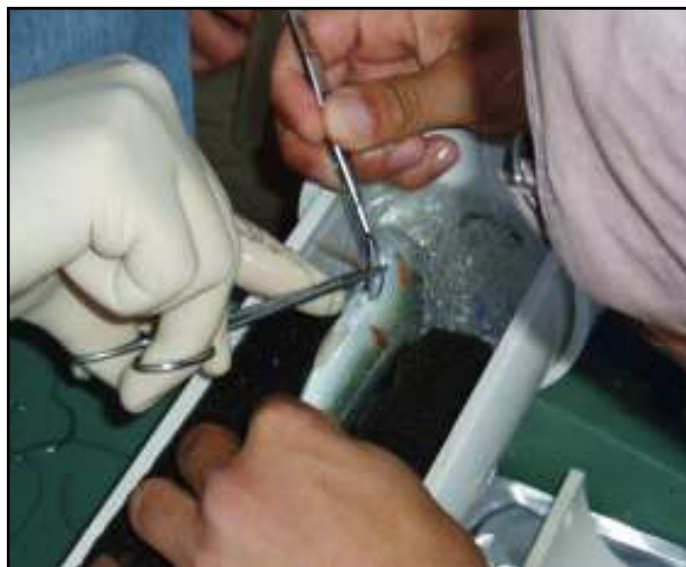
A small coastal cutthroat ( O. clarki clarki ) is stitched up after a tag has been inserted.

Since the beginning of this study the Tribe (and others) have experimented with tagging other species such as wild coho, steelhead, Chinook, cutthroat and lingcod.